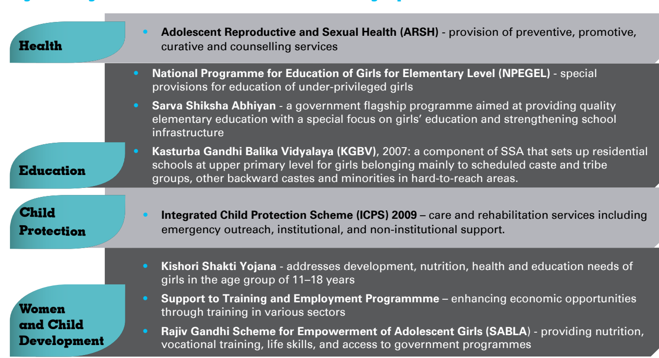
Figure 1: Programmes and Schemes to Address Child Marriage by Government of India

22. End Child Marriage: Change perceptions and beliefs, UNICEF 2013